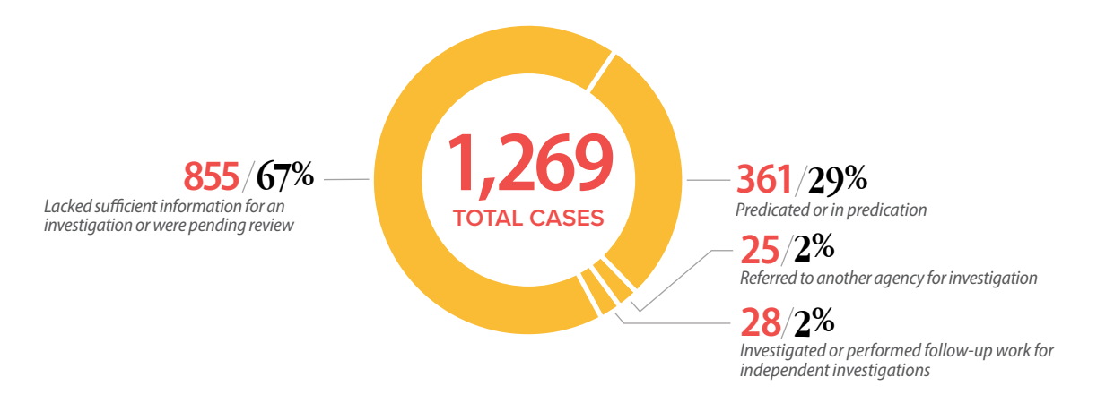
Figure 1 Status of 1,269 Cases, January 2022 Through December 2022

During the one-year period covered by this report, we conducted investigative work on 1,269 cases that we opened either in previous periods or in the current period. As Figure 1 shows, 855 of the 1,269 cases lacked sufficient information for investigation or were pending preliminary review. For another 361 cases, we conducted work or will conduct additional work—such as analyzing available evidence, contacting witnesses, and requesting information from state agencies—to assess the allegations. We referred another 25 cases to the respective agencies so they could investigate the matters further, and we independently investigated or performed follow-up work on implementing recommendations for another 28 cases.